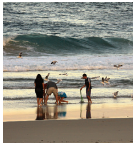
Enjoying the beach adjacent to The Ruins Camping Area

The Booti Hill and lakeside walking tracks immerse visitors in the park's varied landscapes. Complementing the park on its western boundary, Wallis Lake is ideal for boating and windsurfing.