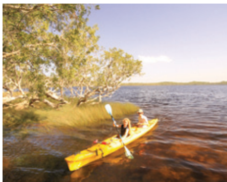
Canoeing, Myall Lakes