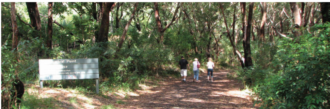
On the track to Sugarloaf Point Lighthouse (OEH)