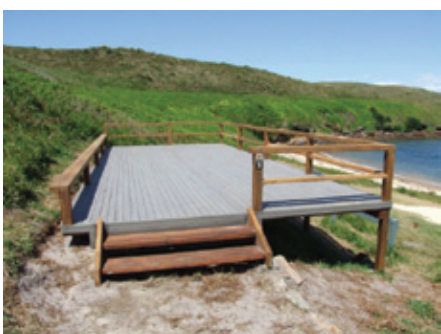
Camping Platform, Broughton Island