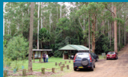
Gu-rum-bee, Wallingat NP

You can stay overnight in the former lightkeepers cottages (bookings required ph 02 4997 6590), or just enjoy a short 500m stroll to this remarkable historic precinct adjacent to Seal Rocks.