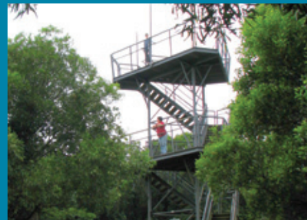
Cape Hawke lookout tower (OEH)

The forest roads of Wallingat National Park make for a memorable scenic drive experience. Gu-rum-bee Picnic Area provides an ideal start to the experience.