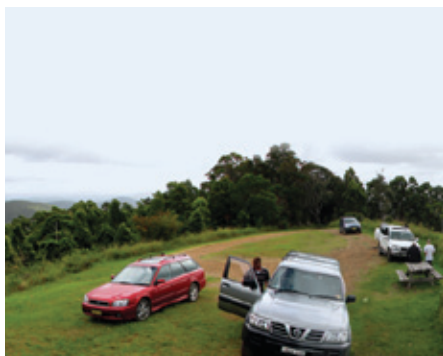
Whoota Whoota Lookout