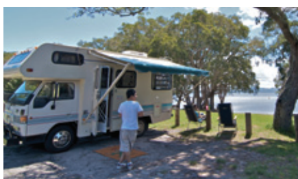
Camping at Mungo Brush Myall Lakes NP (OEH)

The coastal forests along the western side of the park include the state's tallest tree – the Grandis- a giant flooded gum.