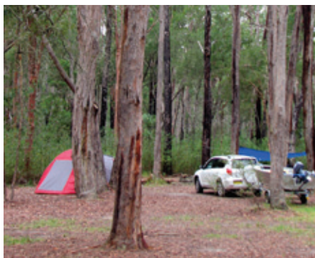
Camping by the Wallingat River (OEH)

Wander the tracks around Sugar Creek or bring your mountain bike and make a more adventurous tour around the Park.