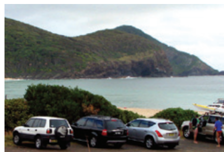
Elizabeth Beach looking across to Booti Booti NP

Elizabeth Beach: The imposing Booti Hill in Booti Booti NP provides a dramatic backdrop to Elizabeth Beach. The beach is seasonally patrolled and is a good swimming beach for families.