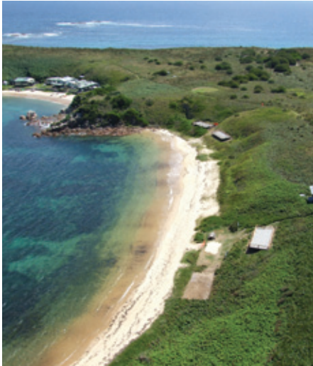
Broughton Island (OEH)

Little Poverty Beach Campground on Broughton Island offers visitors a unique camping experience, with some of the most spectacular coastal views in Australia. It is the only island in NSW where you can camp.