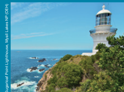
Sugarloaf Point Lighthouse, Myall Lakes NP

The inspiring coastal forests along the western edge of the park include the state's tallest tree – The Grandis – a giant flooded gum.