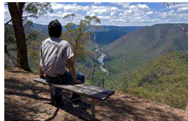
Enjoy stunning views across the Shoalhaven River from Mt Ayre